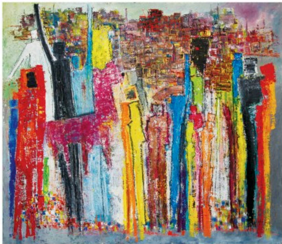
The Red Dog Oil on canvas 59 x 59 in. or 150 x 150 cm