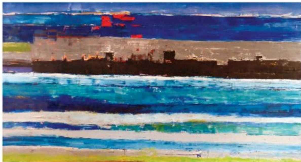
Above: Fishermen's Town Oil on canvas 71 x 47 in. or 180 x 120 cm Below: Cityscape II Oil on canvas 59 x 29 in. or 150 x 75 cm